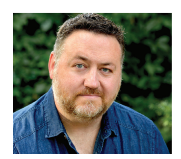
"We want to place theatre students in a production their first semester, so they can apply what they're learning in the classroom right away."