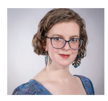
"Our theatre students emerge with a portfolio of work that will help launch their careers in the professional world."