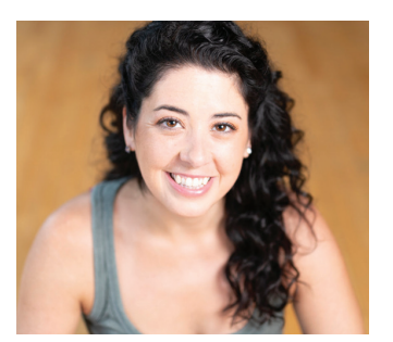
"We give students the tools to succeed while encouraging curiosity in all areas of theatre. Our approach creates wellrounded, thoughtful theatre artists."